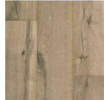
Trinket Oak | 04