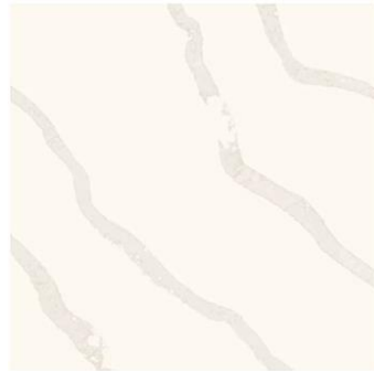
Statuary Glory - QTZ L3