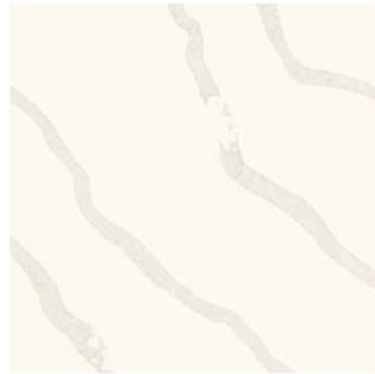
Statuary Glory - QTZ L3