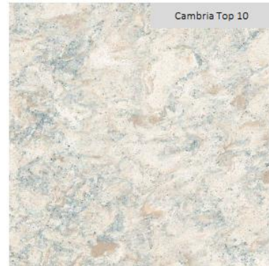
Montgomery © - QTZ L2