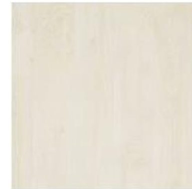
White Satin Oak | 04