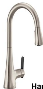
Handle: Stainless Steel