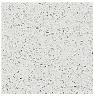
White Quartz 3cm