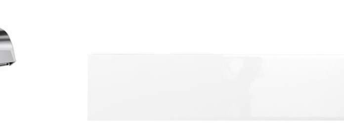
igle Lever Chrome Tub Wall Tile