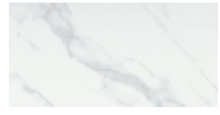
12x24 Shower Wall Tile