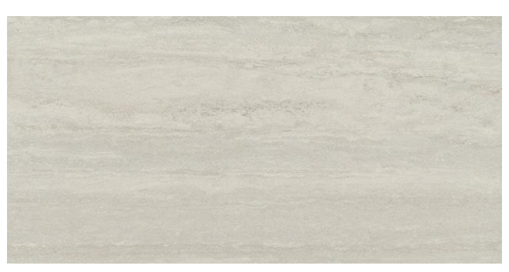
Shower Wall Tile 12x24