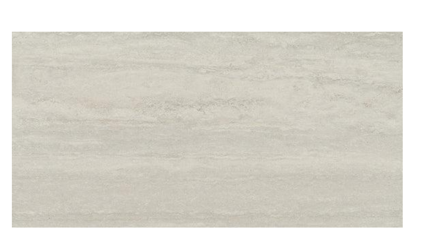
12x24 Floor Tile