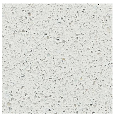
White Quartz 3cm