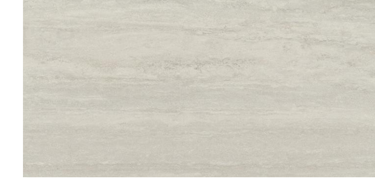
12x24 Floor Tile