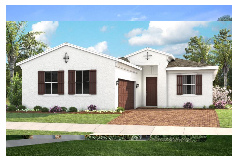
ELEVATION - B - SPANISH

Bedrooms: #3 Bathrooms: #3 Move-In Date: March 2025