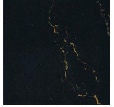
Woodcroft ™ - QTZ L2