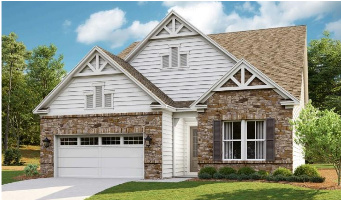
Artist Rendering of Madison Model, Elevation AS- Heritage Stone