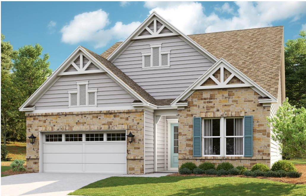
Artist Rendering of Madison Model, Elevation AS- Heritage Stone