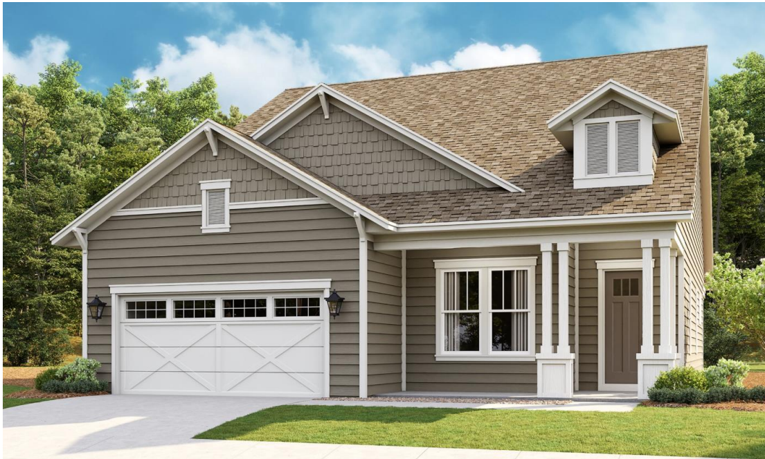
Artist Rendering of Grace Model, Elevation BH- Craftsman