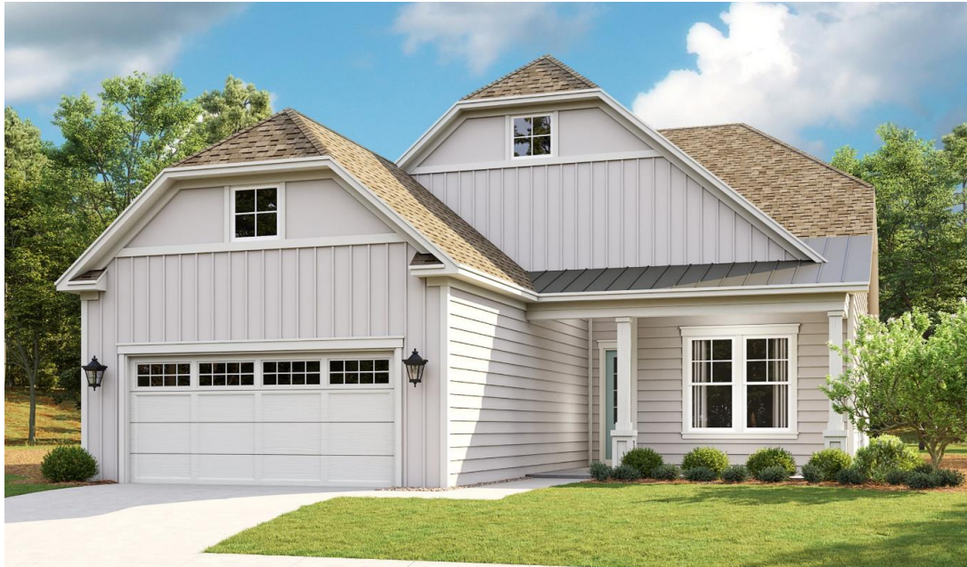
Artist Rendering of Lila Model, Elevation CH- Farmhouse