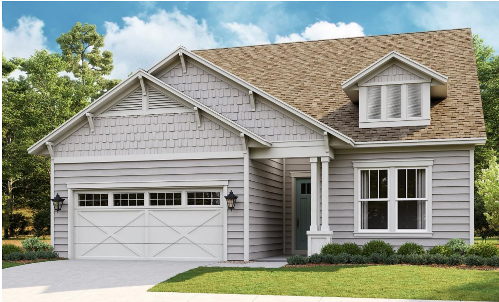
Artist Rendering of Julia Model, Elevation BH