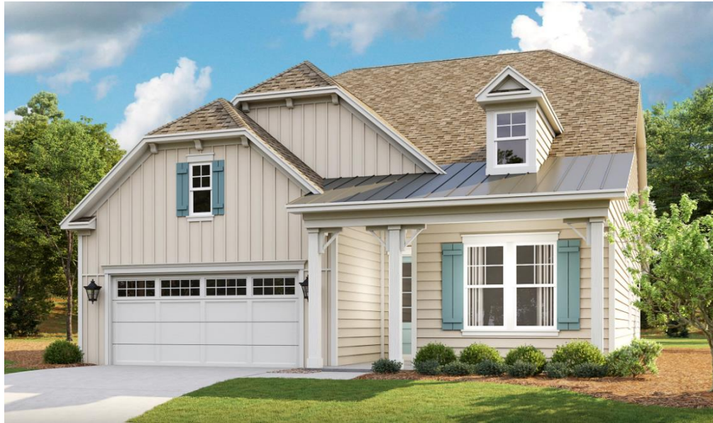
Artist Rendering of Madison Model, Exterior CH