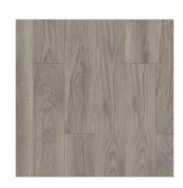
FEATURE NAME FEATURE NAME