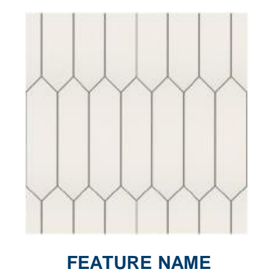
ME FEATURE NAME