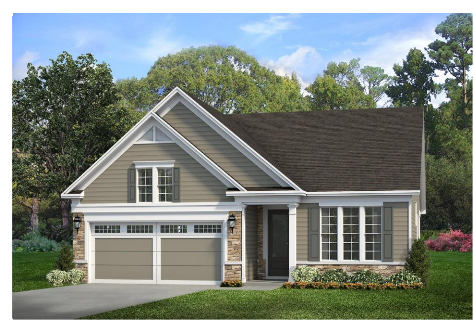
ELEVATION: AS - Left