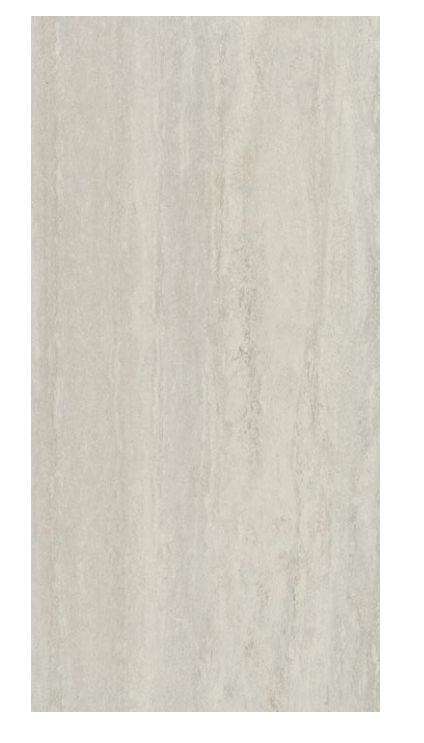
12x24 Floor Tile