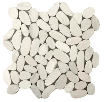
Shower Floor Tile