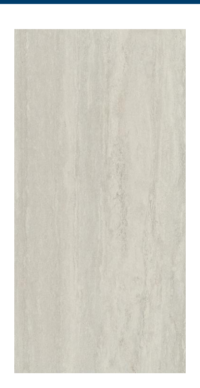
Wall Tile - 12x24 White