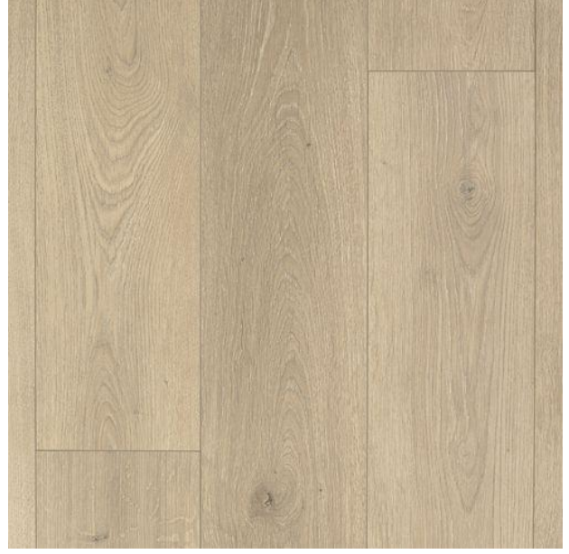
Laminate Wood Plank Flooring